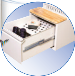
Drawer features a removable, ventilated body armor tray