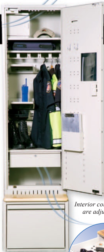
Interior components are adjustable