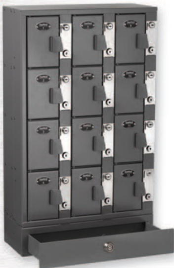
shown with optional cash box

Manufactured of 16 gauge steel, these lockers provide storage for small items such as cell phones or PDA's that are not permitted in federal buildings, courthouses, etc.