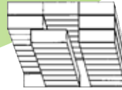
TriSlider System (T632LT8 shown) Storage Capacity - 1,960 LFI* Footprint - 32 Square Feet